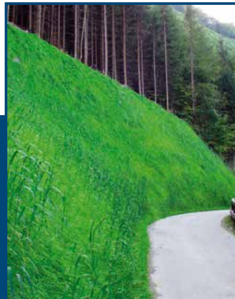
Successful stabilization using the Krismer System