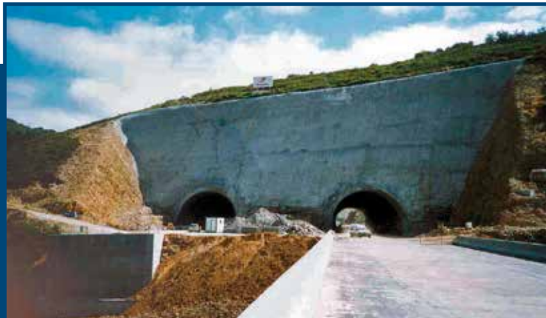
Revegetation over previously shotcreted slopes | As Neiras (Spain)